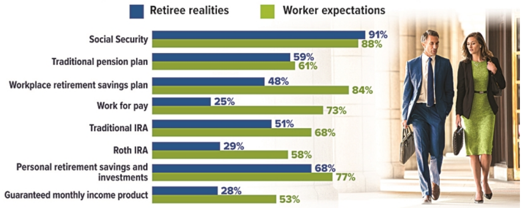
Worker expectations for retirement income vs. retirees' actual experience